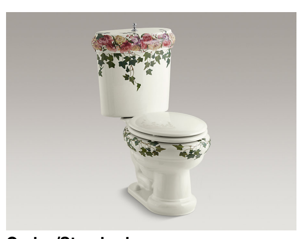
Codes/Standards ASME A112.19.2/CSA B45.1

Additional included component/s: Tank cover, Flush actuator, Bolt cap accessory pack, Tank accessory pack, and Toilet seat.